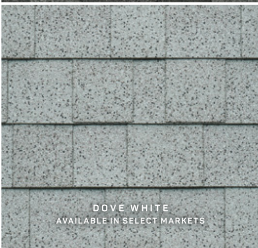
DOVE WHITE AVAILABLE IN SELECT MARKETS

IMPORTANT! To ensure complete satisfaction, please view several full-size shingles and an actual roof installation prior to final color selection as the shingle swatches and photography shown online, in our brochures and in our ROOFViewer ® tool may not accurately reflect shingle color and do not fully represent the entire color blend range, nor the impact of sunlight.